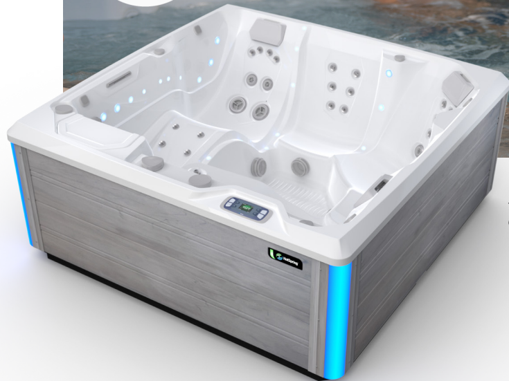
Shown with Alpine White Shell and Coastal Grey Cabinet