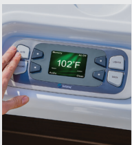
Colour LCD Display